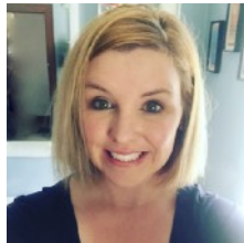
Executive Assistant & Buckhannon Impact Director