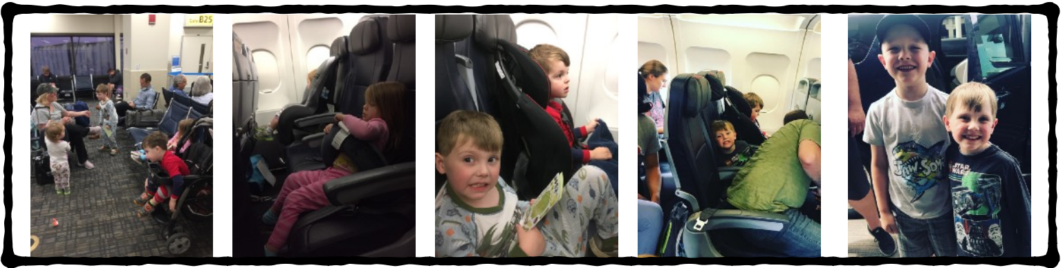
Above: Traveling anywhere is not easy with four kids. They did great!